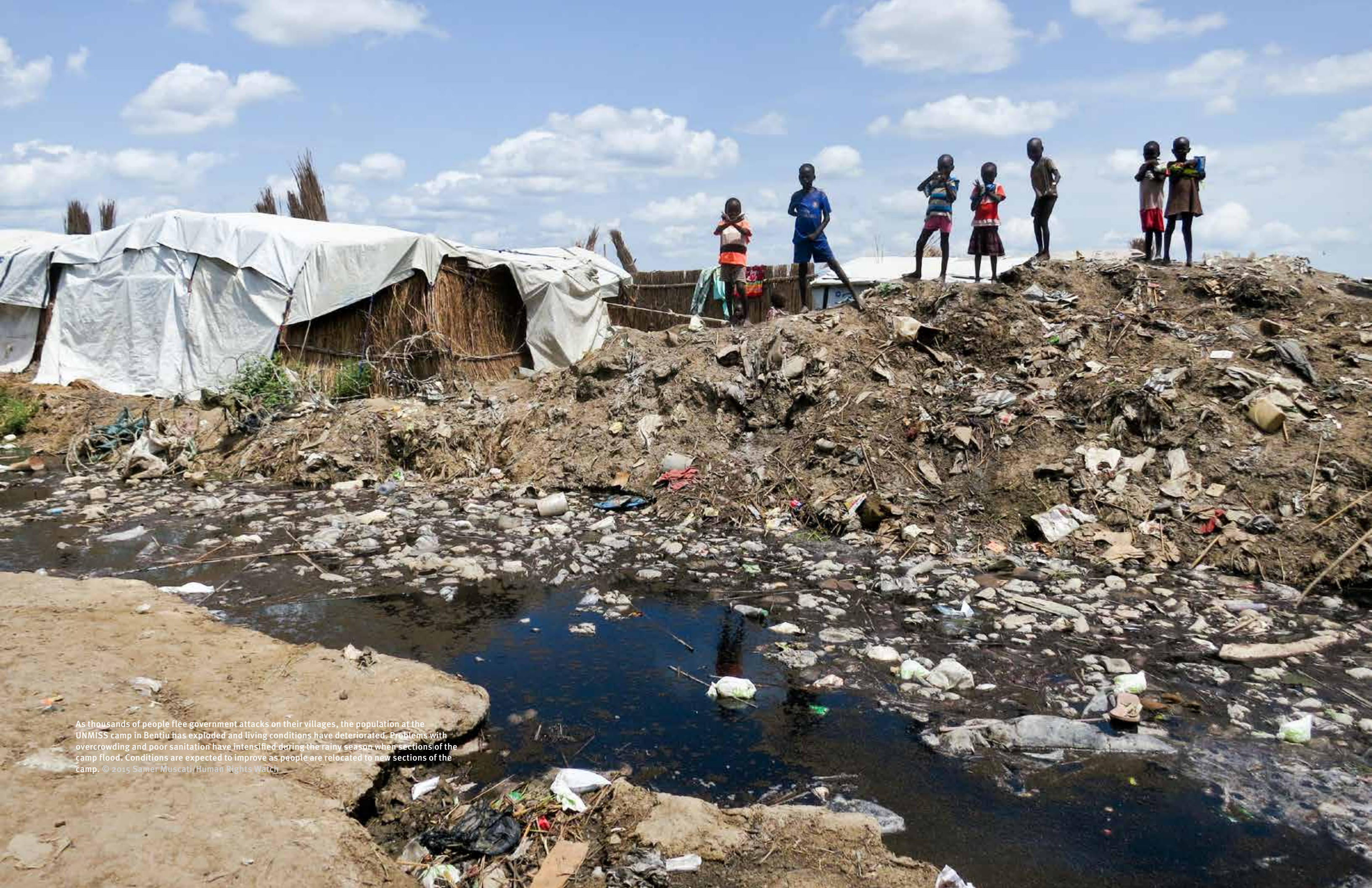
As thousands of people flee government attacks on their villages, the population at the UNMISS camp in Bentiu has exploded and living conditions have deteriorated. Problems with overcrowding and poor sanitation have intensified during the rainy season when sections of the camp flood. Conditions are expected to improve as people are relocated to new sections of the camp.