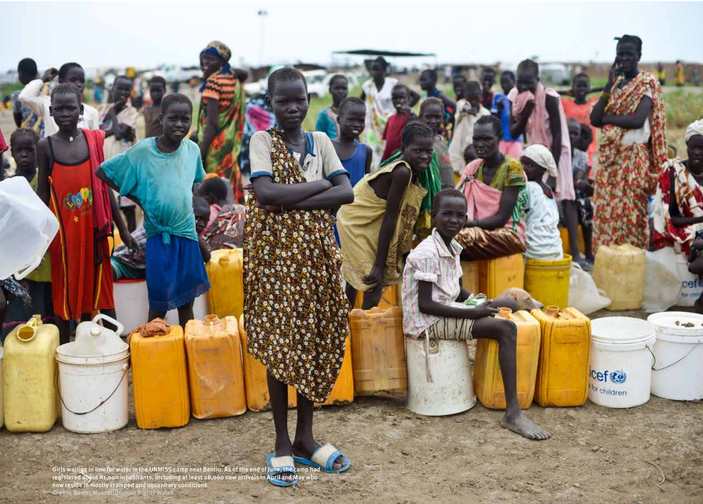
Girls waiting in line for water in the UNMISS camp near Bentiu. As of the end of June, the camp had registered about 81,000 inhabitants, including at least 28,000 new arrivals in April and May who now reside in mostly cramped and unsanitary conditions.