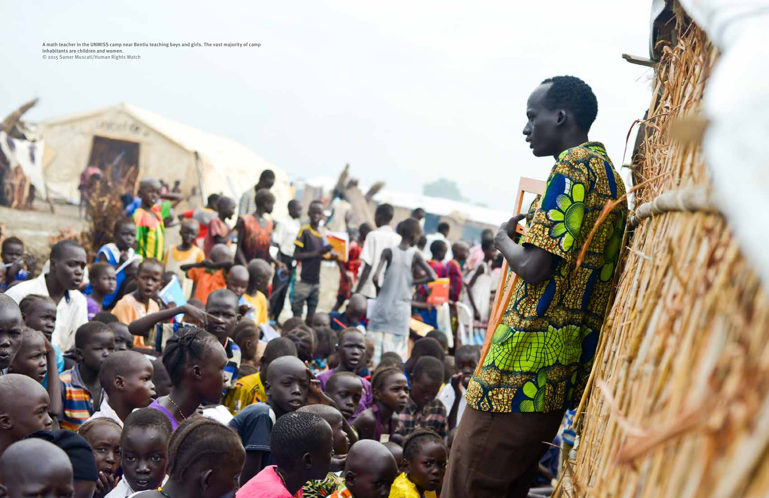
A math teacher in the UNMISS camp near Bentiu teaching boys and girls. The vast majority of camp inhabitants are children and women.