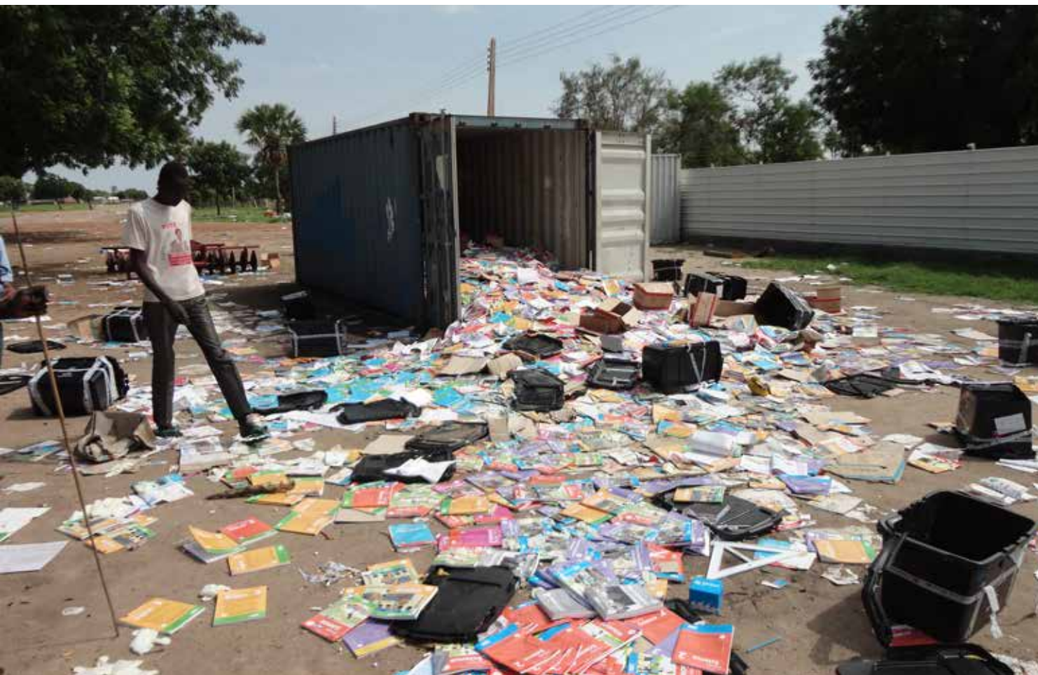
In Koch, two containers of school textbooks had been opened and their contents strewn into the mud. UNMISS officials found that in every place they visited in May 2015, humanitarian materials such as seeds, medical equipment and medicines or educational materials had been destroyed during attacks by government forces in April and May 2015.

Witnesses described similar tactics in each village—fighters would set thatch on the roofs of the tukuls on fire with a cigarette lighter or burning stick, usually starting with the two corners in front of the house before lighting the back corners.