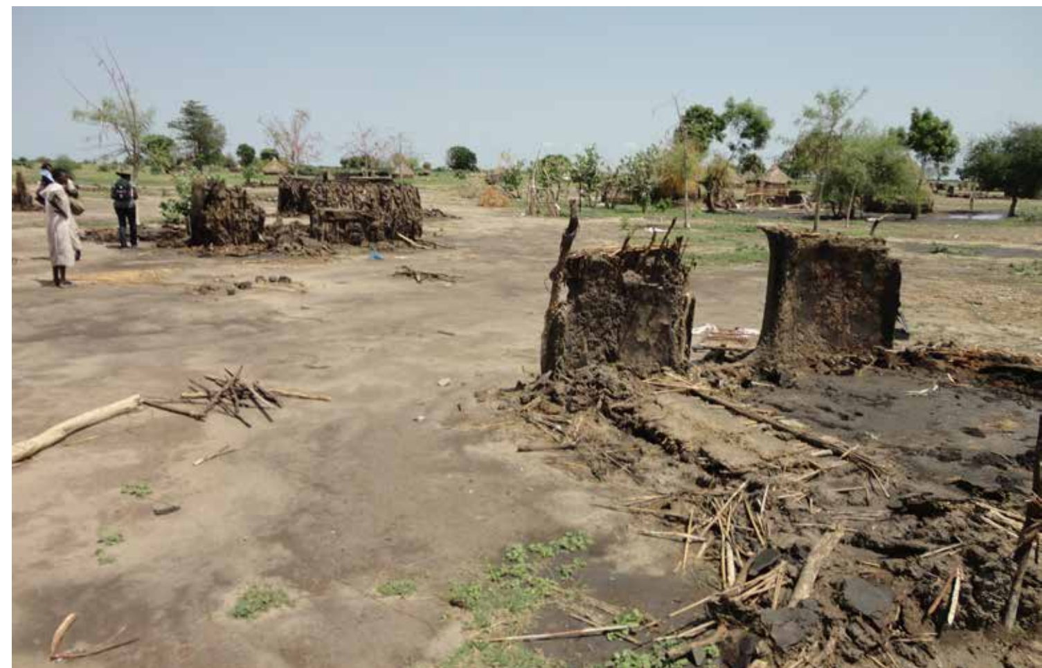
During a visit in May, UNMISS staff found that parts of Nhialdiu town, Rubkona county, had been burned down, including these huts..

Government forces also burned homes and other civilian property in their May offensive into southern Unity state. According to more than 20 people Human Rights Watch spoke to in July who had fled Mayendit town, Mayendit county, and surrounding villages, most of the town was burned following the government’s defeat of armed local defense forces on May 12. After attacking and then fighting off IO and local fighters in the port of Taiyer, Panyijiar county, on May 13, government soldiers burned the entire settlement leaving only a school standing. Government forces only held the town of Nyal, Panyijiar county for a day before the local defense force recaptured the town, but while the government forces had control of the town, they burned several neighborhoods there. Witnesses told Human Rights Watch researchers that they saw government soldiers lighting thatch with lighters or