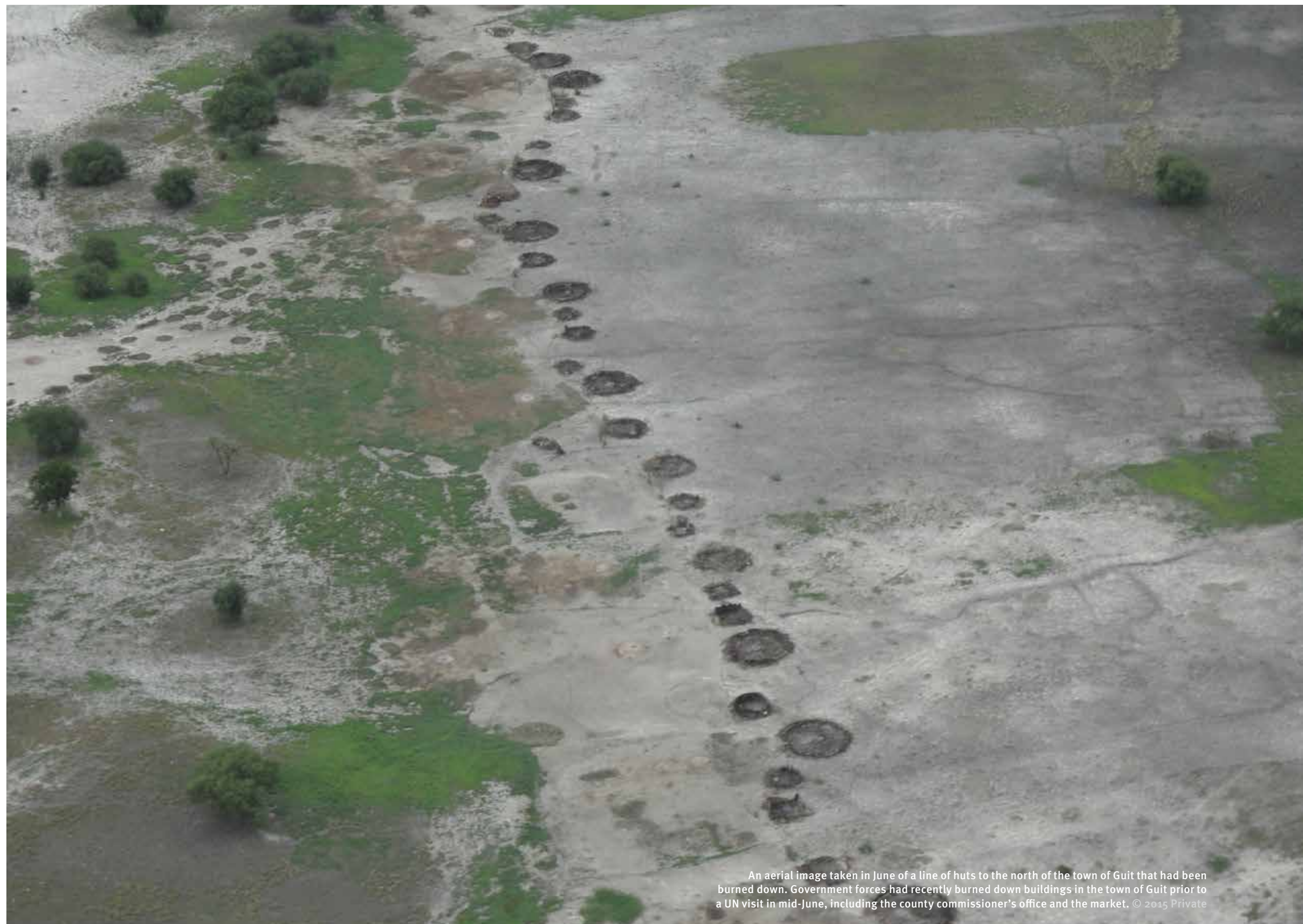
An aerial image taken in June of a line of huts to the north of the town of Guit that had been burned down. Government forces had recently burned down buildings in the town of Guit prior to a UN visit in mid-June, including the county commissioner’s office and the market.

However, the patterns of attacks documented by Human Rights Watch—the repeated burning of homes and